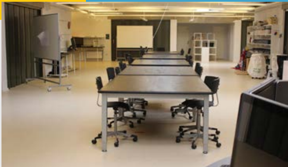
Central area of the ISB Creator Space. Each folded door leads to a specialized room such as a wood shop, sewing room or art room

“How can we design a Creator Space for our young students?”