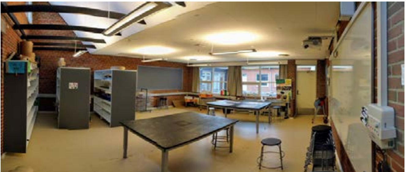
View of the Clay Room.

The question of how to make the Creator Space more inviting and useful for Kindergarteners has come up before at the school. Although they have used parts of the main Creator Space in the past, schedule and time management became issues with older classes. Kindergarten teachers want a place where the smaller children can create and store large projects, without space being an issue. The idea of a Kindergarten Creator Space surfaced in Study Group, and left kindergarten teachers wondering how to make a room available for their children. The administration knows about the teachers' wish for a Creator Space that feels like a Kindergarten Space. They even have a room in mind to work on.