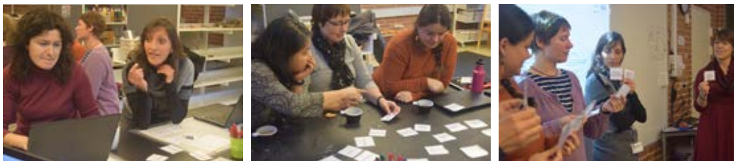
Teachers choose cards to identify their favorite values that children can learn through making