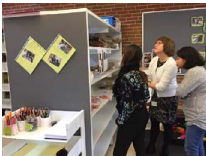
Kindergarten teachers explore documentation during Gallery Walk. The guiding question was, "What do children do in the K Creator Space?"

Today, the teachers are once again gathering in the Kindergarten Creator Space for Study Group, but this meeting feels different. They've organized a "gallery walk" of their work, with documentation posted on the walls. The guiding question teachers used to frame their documentation is, "How do children explore the Kindergarten Creator Space?". There are many different experiences, with some children diving right into exploration, and others feeling shy about the loose structure and freedom of the room. For example, when K3B children used the Kindergarten Creator Space to complete their unit on Communities, students were allowed free access to the candy wall to construct small buildings. Several girls hesitated and asked before taking items out of the bins, a few other students looked carefully into each bin before choosing the materials they wanted to use to build their house, and one student picked an excessive amount of items. The K3B teachers feel that it might have been a little overwhelming for one or two children in the class to have so much freedom in making, and this sparks a conversation within the Study Group about tailoring the presentation of materials to match teachers' knowledge of particular children.