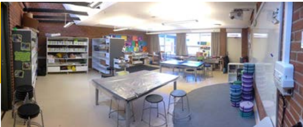
The Kindergarten Creator Space

It’s April now, and the Creator Space has been used by the Kindergarten classes for the past few months. Children have explored such activities as foot-painting, KIBO robotics, building large models of houses, and investigations of materials using the light table. The Study Group has worked out a weekly schedule that allows everyone to access the space regularly. They can also make special arrangements to book the room after checking with the Study Group, Awanti, and the school administration. Laura continues to manage the materials and teacher requests for the room, volunteering part of her prep hours every week to as Kindergarten Creator Space Coordinator. She feels everyone is working together to keep the space warm and inviting for the children. The Essential Agreements that the group developed collaboratively are posted. Laura is pleased to find that classes adhere closely to the guidelines for number of children in the space, instructions to wear indoor shoes, and how to leave the room for the next group.