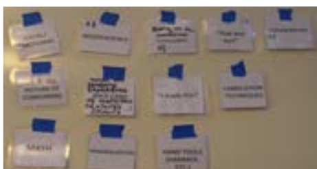
The values cards chosen by the K teaching team