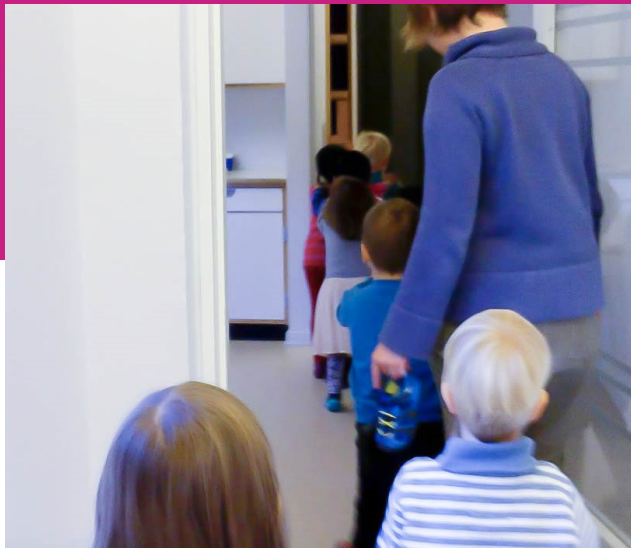
Driving the train to the library