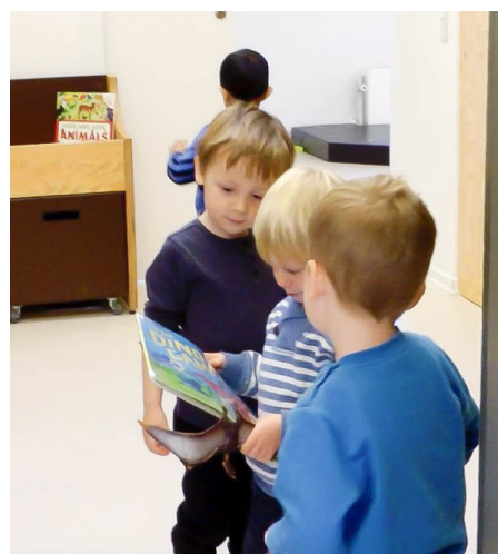
Dinosaur book at the library