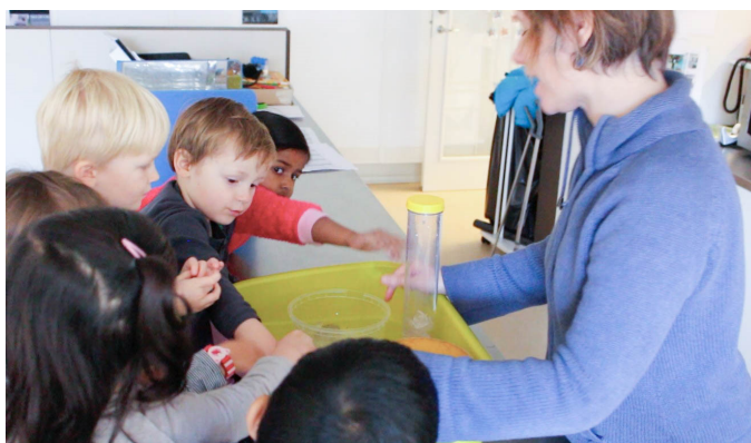
The ice experiment continues