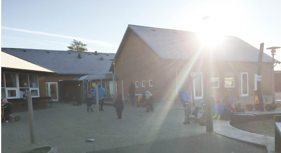
The ISB playground

Outside, it's a beautiful frosty morning in Billund. It's nearly 10am, and the sun is just peeking over the roof of the school.