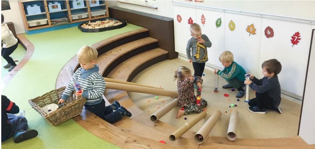
Balls and tubes continued