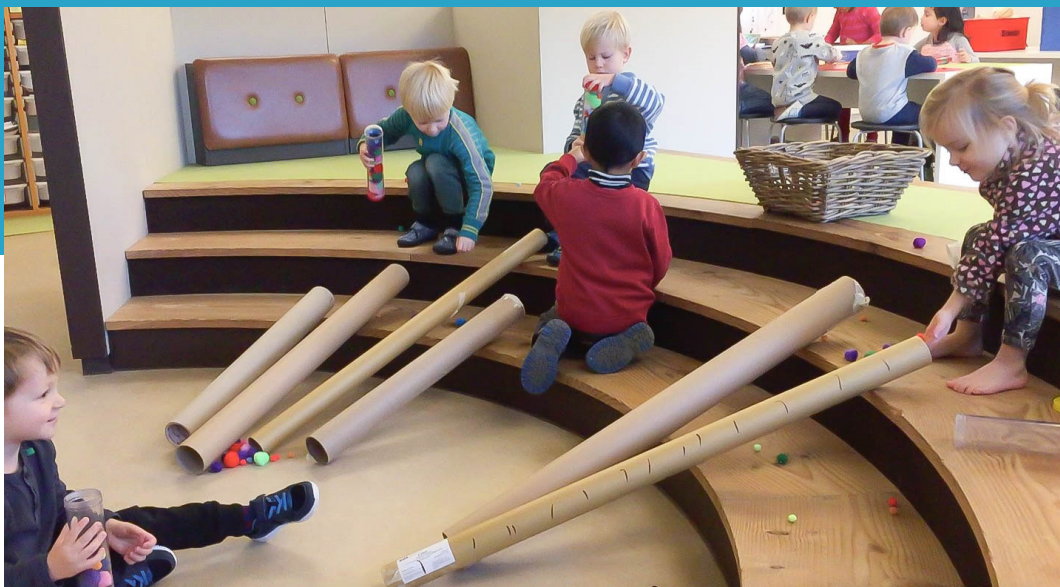
Martin and Lotte playing with tubes

Lotte: Only yellow – put only yellow here.