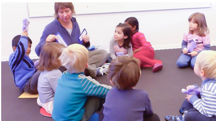
Circle time continued