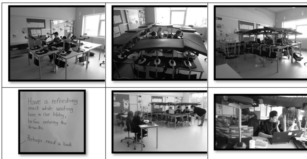
FIGURE 3: THE EVOLUTION OF VERSAILLES

In the M8 classroom, three M9 students started to build an office space out of some tables. Over the course of a morning, the structure turned into the ‘Bastille’, and ultimately ‘Versailles’. Having just finished a history unit on the French Revolution, the M9 students challenged themselves to add something new to the castle each day (Figure 3). ‘Versailles’ elicited a range of reactions. Some students felt like the castle excluded them from the classroom since it used up most of the chairs. Others thought it was a creative act and did not mind the lack of seating.